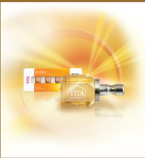
3 VITA Suprinity® von VITA Zahnfabrik – H. Rauter GmbH & Co. KG